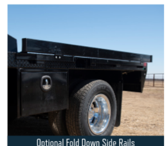
Optional Fold Down Side Rails