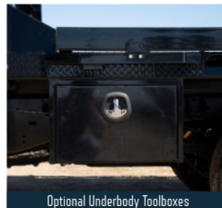
Optional Underbody Toolboxes

NOTABLE OPTIONS INCLUDE: 3/16" Heavy-Duty Deck, Steel SK Deluxe can have Flush Mount 30K lb. Turnover Ball; Color Primer Only; Drop-In or Fold-Down Side Rails; Gooseneck Trough; Rear Rubrail; Wood, Rubber or Blackwood Flooring; Underbody Toolbox; Aluminum Underbody Toolboxes (AL RD model)