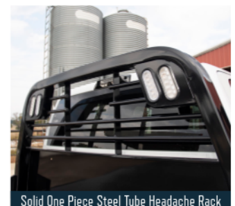
Solid One Piece Steel Tube Headache Rack