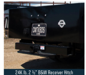
24K lb. 2 1/2" B&W Receiver Hitch