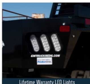
Lifetime Warranty LED Lights