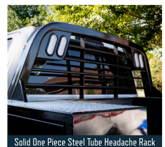
Solid One Piece Steel Tube Headache Rack