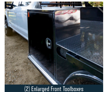
(2) Enlarged Front Toolboxes