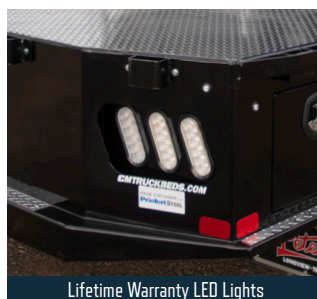
Lifetime Warranty LED Lights