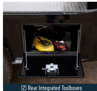
(2) Rear Integrated Toolboxes

Top notch features and hardware on the SK models include a best-in-class tubular headache rack, LED lighting, top-rated B&W hitches, and integrated toolboxes. On the SK Deluxe, if you are looking for great tool storage, you will see two enlarged front toolboxes on this body. This will allow you to store all of your tools in the optional CTech or American Eagle drawers. Be sure to check out this best-in-class combination of towing and storage.