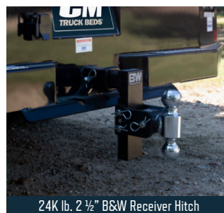
24K lb. 2 1/2" B&W Receiver Hitch