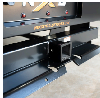
24,500 LB RECEIVER HITCH