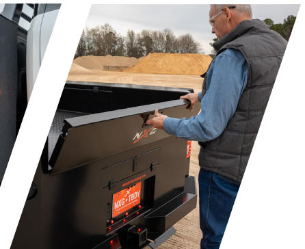
FLUSH MOUNTED REAR TAILGATE