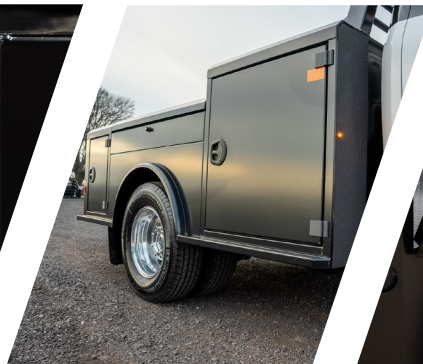
MAXIMUM STORAGE SPACE