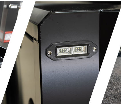
BRIGHT LED WORK LIGHTS